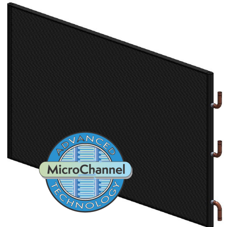
Model: C46.4x80.8x1.25H-24E07-V4297C (E-Coated)