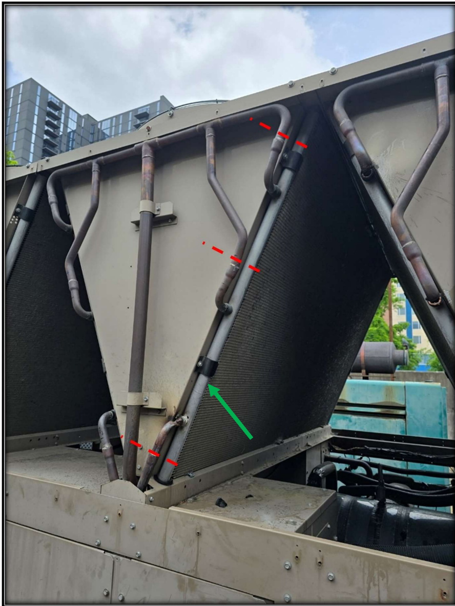
Figure 2. Cut Existing Discharge and Liquid Lines as Shown in Red. Unbolt the coil at 4X locations as shown in Green.