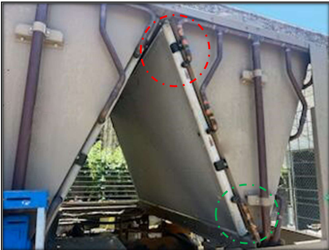
Figure 3. Front of Chiller: Solder Copper Connections as Shown.